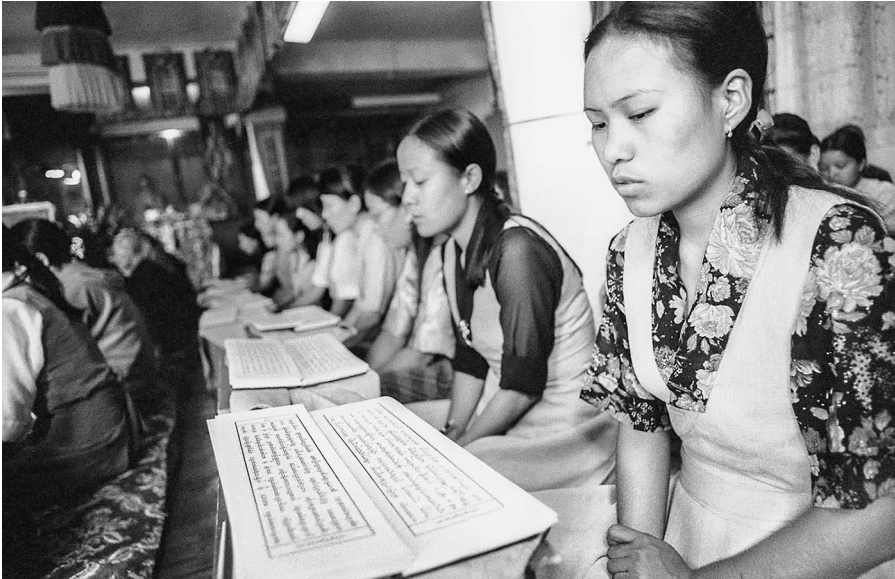
Fig. 1 Dharamsala Men-Tsee-Khang college students.

social and political changes—in this case in the field of Tibetan medicine—of which his previous incarnation could only dream.